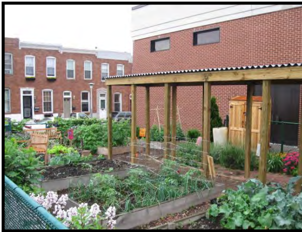
Garden for Life at HHA